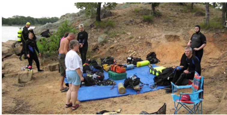
Students getting ready to dive

The first Open Water training session is now in the history books and we have seven newly certified divers and club members. The weather at Lake Murray was a bit touch-and-go with a few sprinkles and over-cast skies through the weekend but fortunately Mother Nature held off and we got all of the dives in without any problems. The students worked through all training skills with only a little nervousness about the murky water and low visibility.